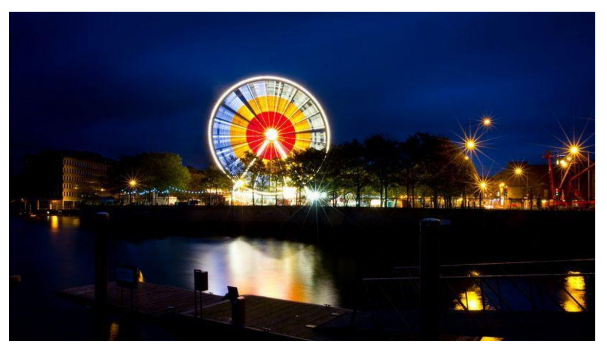
Arthur's Quay Park, (opposite the Arthur's Quay Shopping Centre), Limerick

8^{th} March- 14^{th} April @ 12pm - 9pm